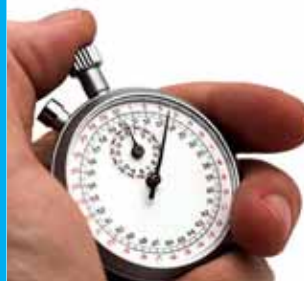
Chart your own course. Decide what you want and the life you prefer, then focus your time, energy and effort to that end. Use the resources available and create a Personal Eco-System(tm) that supports you perfectly, then simply out-work, out-perform and out-last the competition. There are no alternatives. Extraordinary achievement is the result of those four simple steps.

To change your life, change your world. Change your personal environment, the little habits and activities that fill your time, and your life must (and will!) change for you. Will-power won't do it. You are largely the product of your environment, so make sure your world nurtures the person you want to become tomorrow even more than the person you are today.