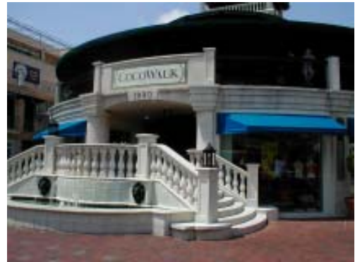
Cocowalk on South Beach tour

Alpha Beta Gamma and the National Dean's list seals on their diplomas! Anyone interested in obtaining Alpha Beta Gamma jewelry, clothing, or other items should check the website for price and order information.