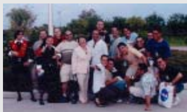
Las Tunas 18 member group at KSC

FALL FLING, October 29 th , the theme is Aliens!