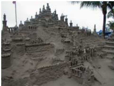
Fantastic sand castle built on the beach